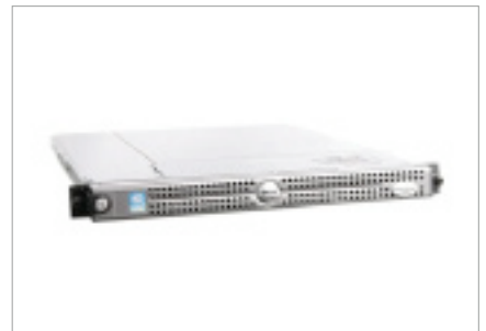
EdgeProtect Server Secure, web based server with all software pre-installed and fully configured.