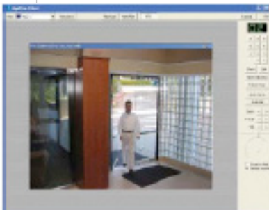
EdgeView Fully configurable DVR/NVR integration.