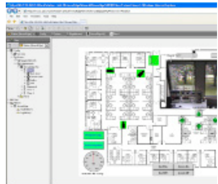
EdgeManager Dynamic floor maps, integrated video and full BAS integration