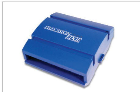
EdgeController IP based, fully standalone access controller